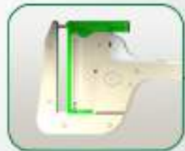
2-Step Controlled Closing