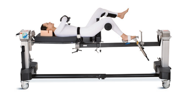
Table Top Length 84 in. (213 cm) Table Top Width 21.5 in. (55 cm)